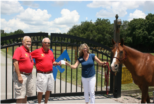
New gate at Special Equestrians