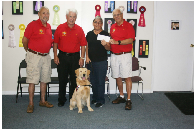
Paws Assistance dogs for Vets