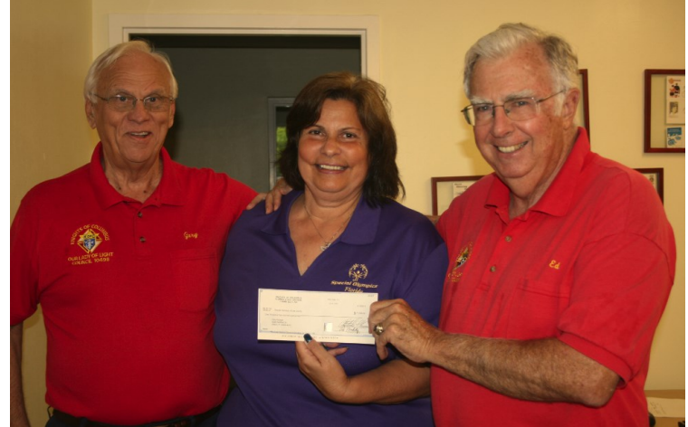
Check presentations to Gabriel House and Special Olympics from our Disability (Tootsie Roll) Drive