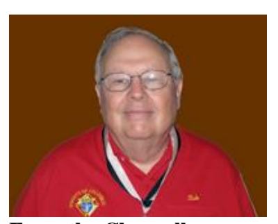
From the Chancellor

May 31 – Planning Meeting Room 308 at 7:00 p.m. All members are welcome to attend especially all committee members for future functions and activities for our Council.